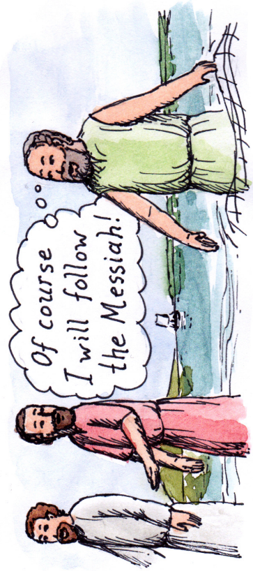
Answer to front page: We have found the Messiah! Answer to Cross-Word: his vocation. www.thekidsbulletin.com

God does not call all of us to very important jobs like the prophet Samuel and Saint Peter. But each of us should follow Jesus and be ready to do His will. If we always try to do what God wants, then we will be ready if He does have a special job for us! How can you do God's will today?